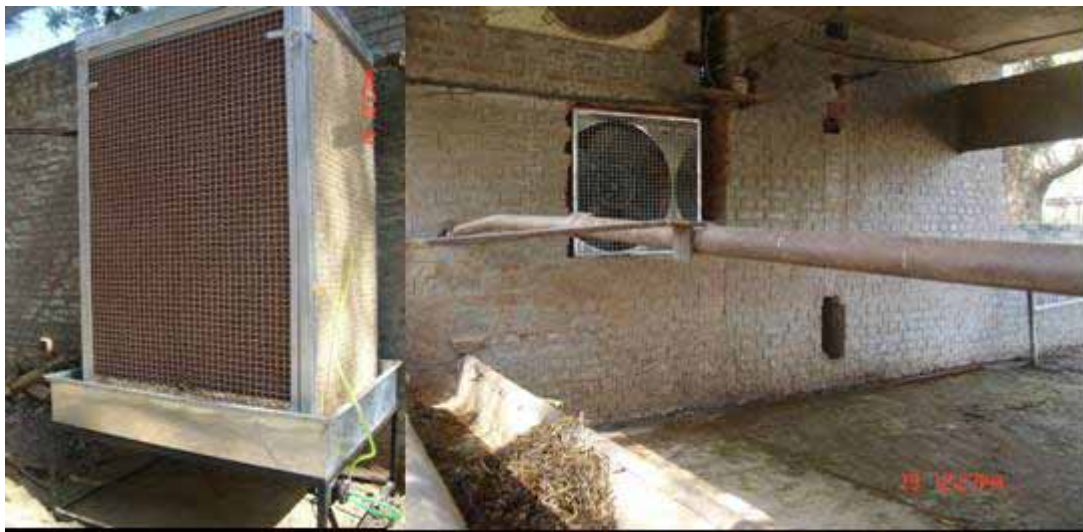
Fan-pad cooling system in cattle shelter at GADVASU

CIPHET has also started another project for poultry comfort with GADVASU. The poultry shelter available in the department of Livestock Production Management, has been segregated into six experimental units, for cage and deep litter system for the layers. The studies are being done with fan-pad and fan-fogger cooling for the poultry.