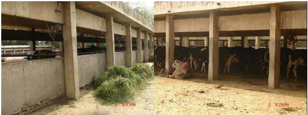
Cattle shelter at GADVASU

The fan and pad cooling system consists of two coolers containing 36" / 700 rpm exhaust fans and pads. The pads are made of cellulose paper housed in a G.I casing with a water distributor through a P.V.C header. The water collecting tank is made of G.I and has a rugged construction. The intricately woven cellulose pads provide necessary water to air contact to achieve high efficiency in cooling. The feeding side and the entrance side of the shelter have been covered with net and tarpaulin to prevent solar radiation input and the cold air from escaping the shelter.