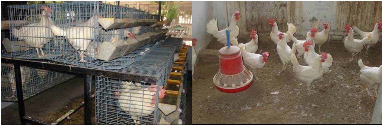
Cage and deep litter system for poultry

enquiries are being received from the dairy farmers for the details like cost and availability of the cooling system components. The successful demonstration and comparative analysis of advantages of cooling system will definitely give a boost to this sector