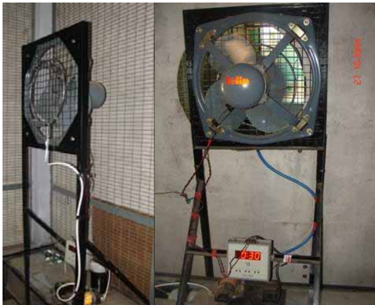
Fan-fogger system at poultry