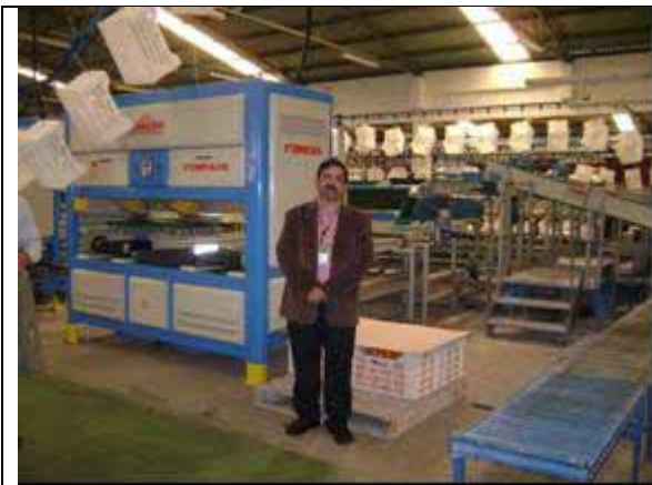
Citrus Pack House