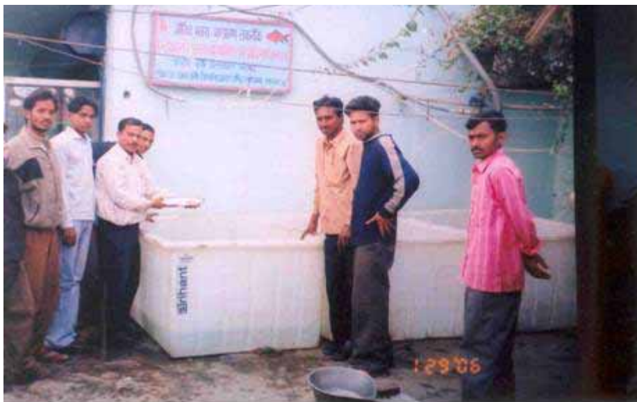
Live fish storage system designed by CIPHET installed in fish market of Ludhiana