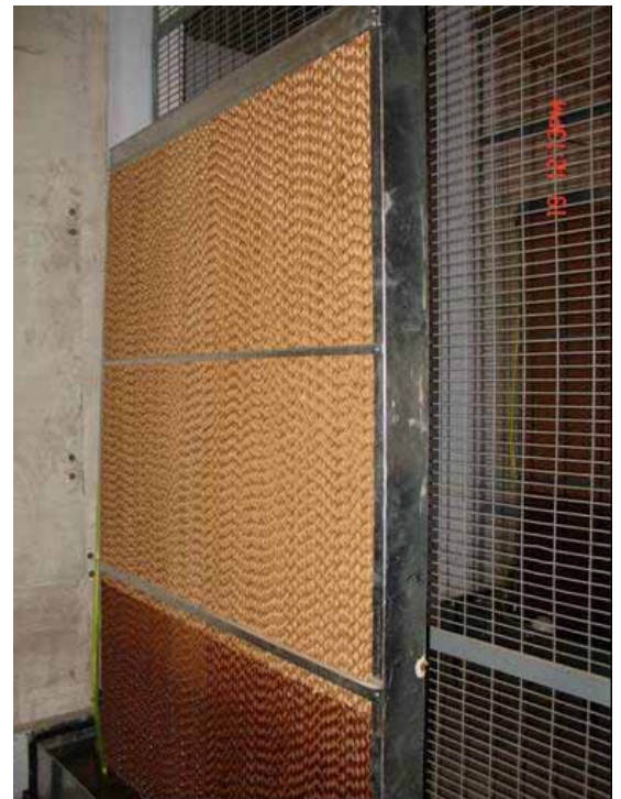
Cellulose pads of fan-pad cooling system for poultry