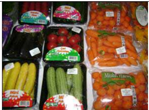
Well Packaged Vegetables with or without MAP