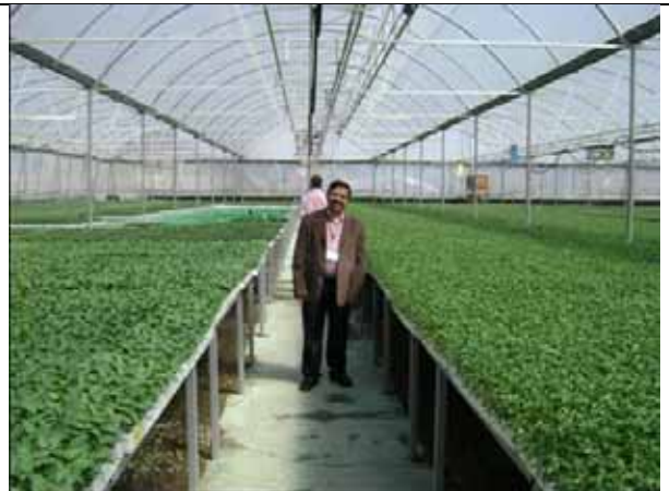
High Tech Green House