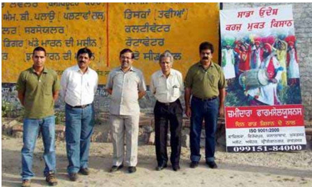
ADG (Engg.), ICAR, Director, CIPHET and Jt. Commissioner Machinery visiting the field centre of Zamindara Farmsolutions