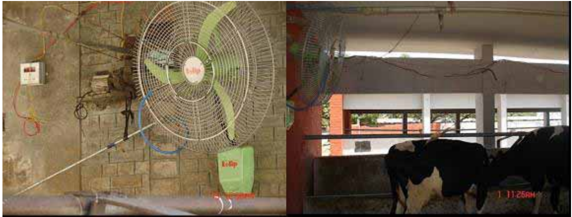
Fan-fogger system fitted at cattle shelter at GADVASU