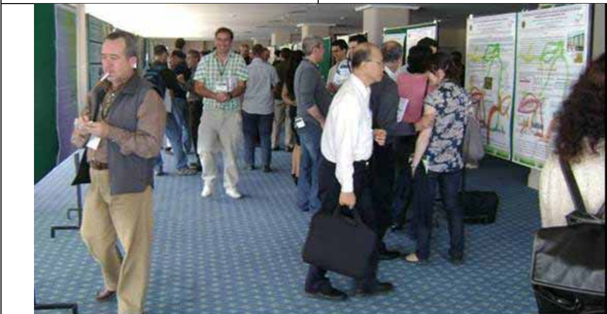
Poster Session during the Conference