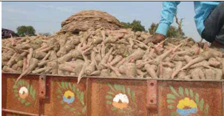
Carrots before washing

Rajasthan wash their produce with simple indigenous equipment using canal water. The capacity of the washer is around 16-20 quintal per hour. The washer is owned by an enterprenur who parks his machine having diesel engine which provides the power for rotation of the washer as well as pumps the water from the canal and sprays on the carrots being washed. By having one washer, entrepreneur is earns around Rs. 1000 per day during season. The equipment cost around Rs. 35,000/- including diesel engine. This idea should be propagated in different part of the country where irrigation canal is accessible for washing of fruits and vegetables. The washing also removes the field heat and cools the fruit which not only improves the look and appearance but also extends the shelf life of fruits and vegetables. This method adopted in Punjab can be easily replicated in other parts of the country for better post harvest management of perishables.