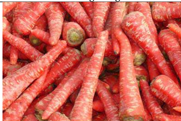
Spreading the carrots on the mat for surface drying