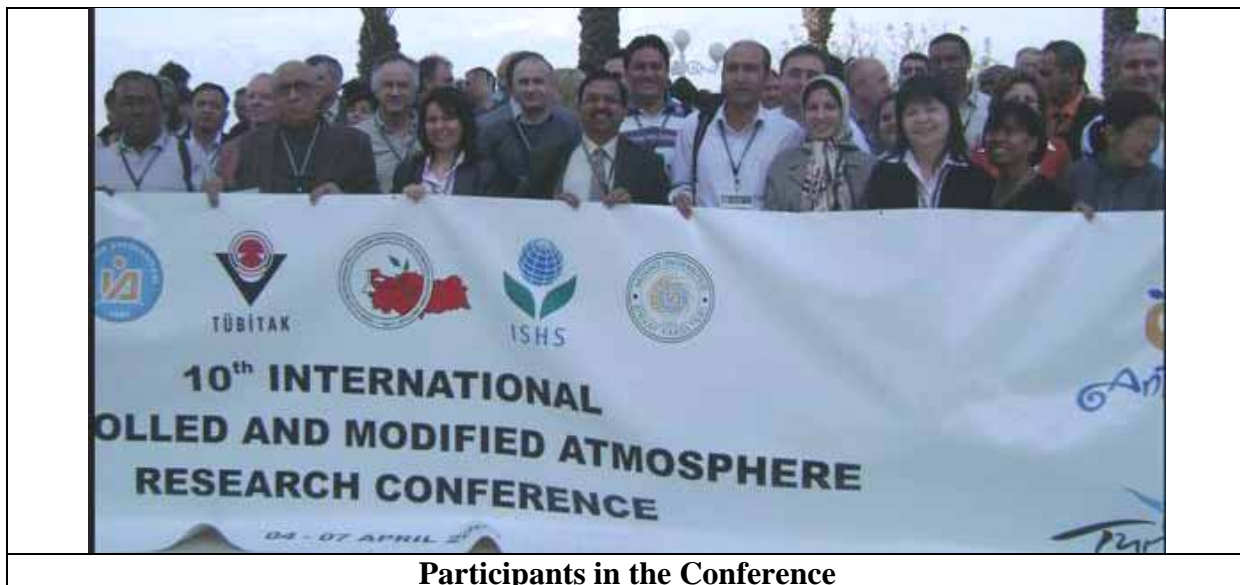
Participants in the Conference