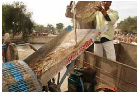
Washer near irrigation canal, the carrots for washing being loaded