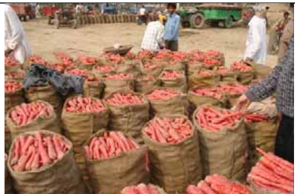
Packaging of washed and dried product fetches 50 to 100% higher price