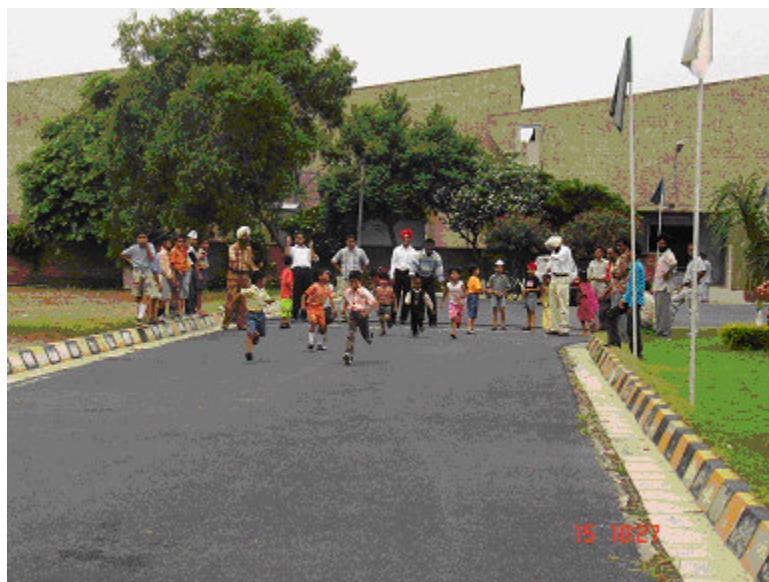
Children enjoying the Independence Day sports events at CIPHET