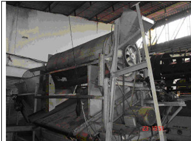
Green pea depodder