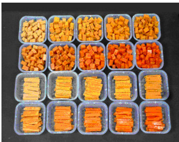
Guava bars with various flavours

The guava bar is a unique preparation of CIPHET and it is not commercially done so far. Next step in this research is scaling up to pilot scale. The bar is not gritty like original fruit. Per kg of guava 250 to 300 gm bar can be prepared.