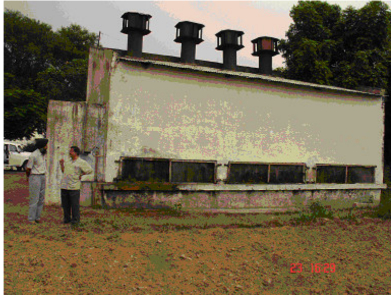
Evaporatively cooled storage structure of 20 tone capacity for short term storage of potatoes

The team also visited CPRI research station at Jalandar to see various types of storage structures for short-term storage of potatoes