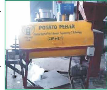
Fig. 7: Potato peeler

kg potatoes in 5 to 10 min. The machine is made of mild steel with two drums rotating in opposite direction. The outer drum is made of stainless steel and inner drum is made of abrasive carborundum roller which peels the potatoes.