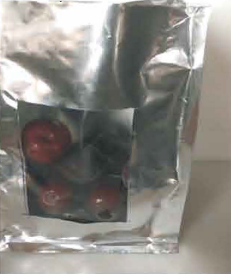
Fig. 5: Plum fruits in active packaging

Experiments on active packaging of plums carried out in Food Packaging and Transportation Laboratory at CIPHET have shown that high level of TSS, anthocyanin content, sugars etc. can be maintained in high barrier films. Metal aluminium laminates were used in this study for maintaining bioactive compounds and sensory quality for high value fruits. Active modification or desired gas mixture combinations were used for flushing into the packaging material. Moisture absorbing pads made up of cellulose and carbon dioxide scavenging material were used in the study to increase the shelf life of plums upto 25 days. By minimizing the rate of respiration through the gaseous modification and packaging materials, the shelf life of high value fruits like plums and strawberry in retail outlets can be extended successfully. Presently, the shelf life of these fruits in cold storage is 8-11 days at 10°C and 85-95% RH.