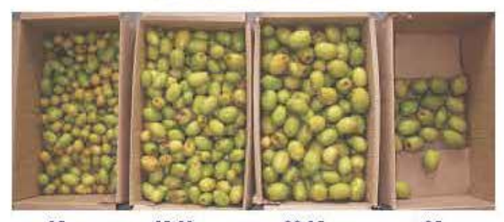
mm 25-30mm 30-35mm >35mm Fig. 3: Ber fruits graded through Compact Fruit Grader

of 16 rpm. The machine has the grading especity of 300 kg/h at this speed. Four different grades of <25 mm, 25-30mm, 30-35mm and >35mm diameter can be obtained through this grader at a time. The machine is suited for both oblong and round fruits and is operated by 1hp electric motor.