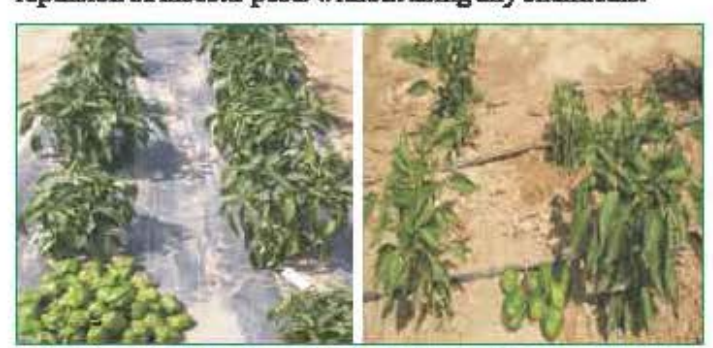
Fig. 4 a. Silver black mulched capsicum plot b. Capsicum plot with no mulching (Control)

Use of blue and black coloured plastic mulch was found most suitable for repulsion of insect/pests from the capsicum field. The yellow colour plastic mulch attracted insect/pests. Highest aphid attack (550-620 aphid/plant) was found in yellow plastic mulched plots followed by unmulched control plots (350-400). Least number of aphids were found in green (30-50), blue (30-50) and black plastic (70-85) mulched plots. In terms of plant growth, more number of branches and leaves with no weed growth was found in green, blue and black plastic mulched plots. While, in yellow and red coloured mulched plots, more weed density was observed. Capsicum viold (kg/plant) in different mulched plots in ascending order was found to be in silver black (3.8 kg/plant) and green (3.4 kg/plant) plastic mulched plots followed by black (3.2 kg/plant), blue (2.9 kg/plant) and red (2.8 kg/plant). Thus silver black (with silver inner lining), green, blue and ordinary black plastics can be recommended for mulching in capaicum field for repulsion of insects/ pests without using any chemicals.