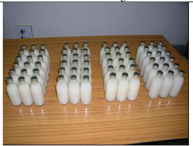
Plain guava beverages

© CIPHET reserves all rights to information contained in this publication, which cannot be copied or reprinted by any means without express permission.