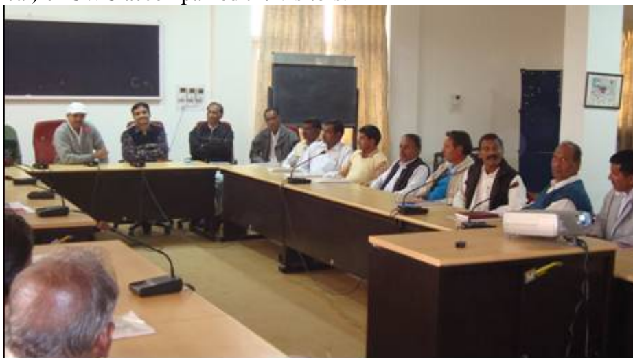
Discussion with progressive farmers at CIPHET Abohar