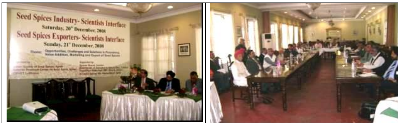
Technical Session in Progress