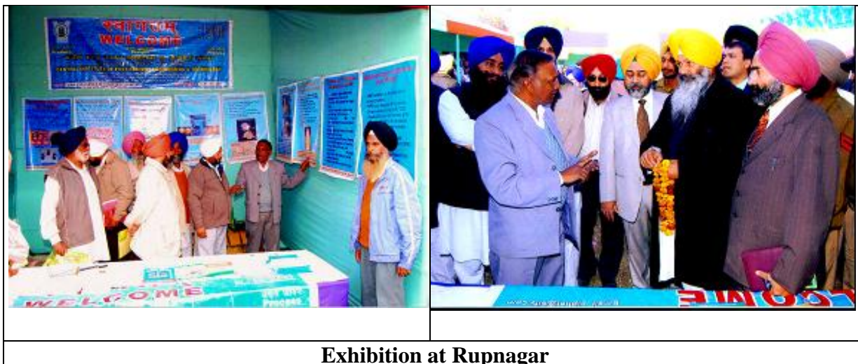
Exhibition at Rupnagar