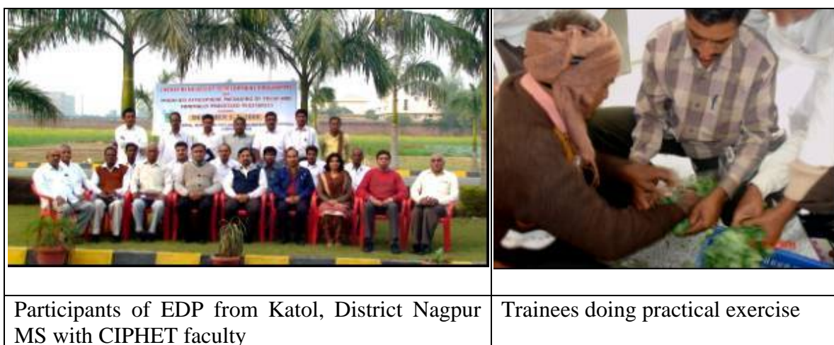
Participants of EDP from Katol, District Nagpur MS with CIPHET faculty

An entrepreneurship development programme on modified atmosphere packaging (MAP) of fresh and minimally processed vegetables was held at Central Institute of Post Harvest Engineering and Technology, Ludhiana during December 1-7, 2008. The aim of the programme was to familiarize the participants with the modified atmosphere technology and to explain its potential benefits for its dissemination and application. Eighteen participants from Katol, District Nagpur, Maharashtra state attended the programme. The participants were exposed to the MAP technology through lectures on harvesting, pre-cooling, on-farm storage, assessment of respiration rates of fresh and minimally processed vegetables, assessment of gas permeability of packaging films, instrumentation, qualitative analysis, design of MAP, minimal processing, storage under TMS, etc. along with hands-on practical trainings. The participants felt satisfied with the programme and were enthusiastic for its further use and dissemination for post-harvest loss reduction and shelf-life enhancement of fruits and vegetables.