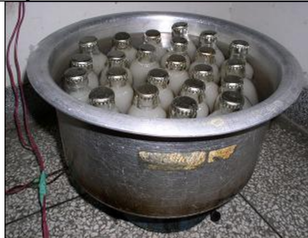
Pasteurization of RTS beverages