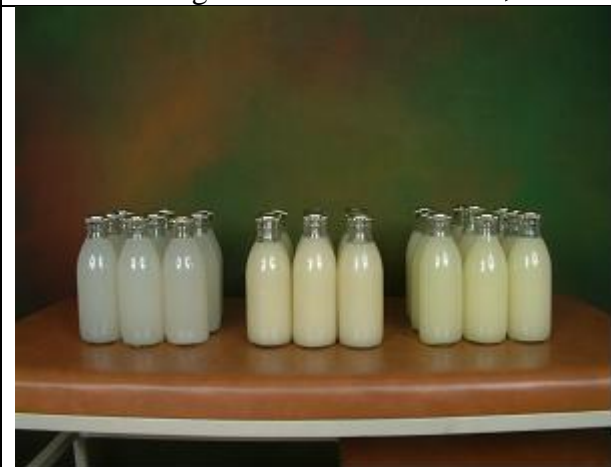
Whey based guava beverages