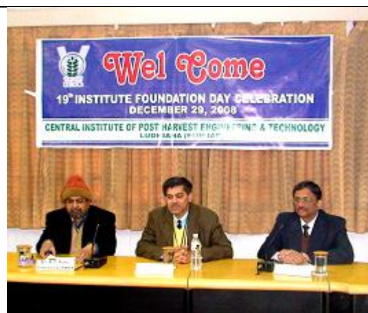
Foundation day celebration at Ludhiana