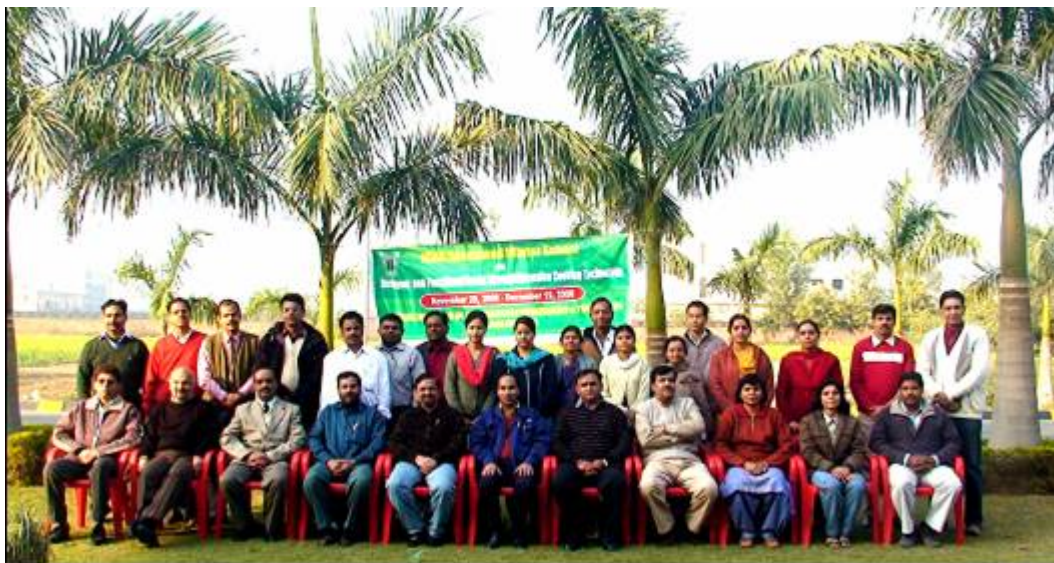
Winter School participants with CIPHET faculty