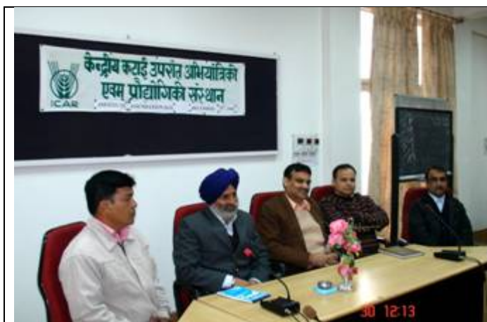
CIPHET Foundation day celebration at Abohar