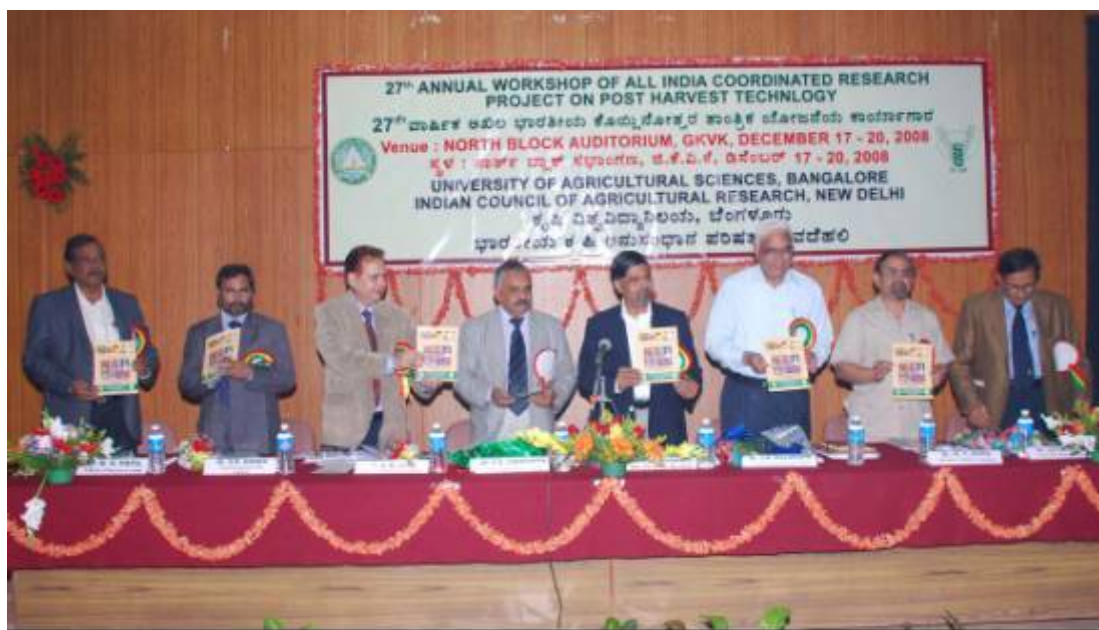
Inaugural Session of 27 th workshop of AICRP on PHT