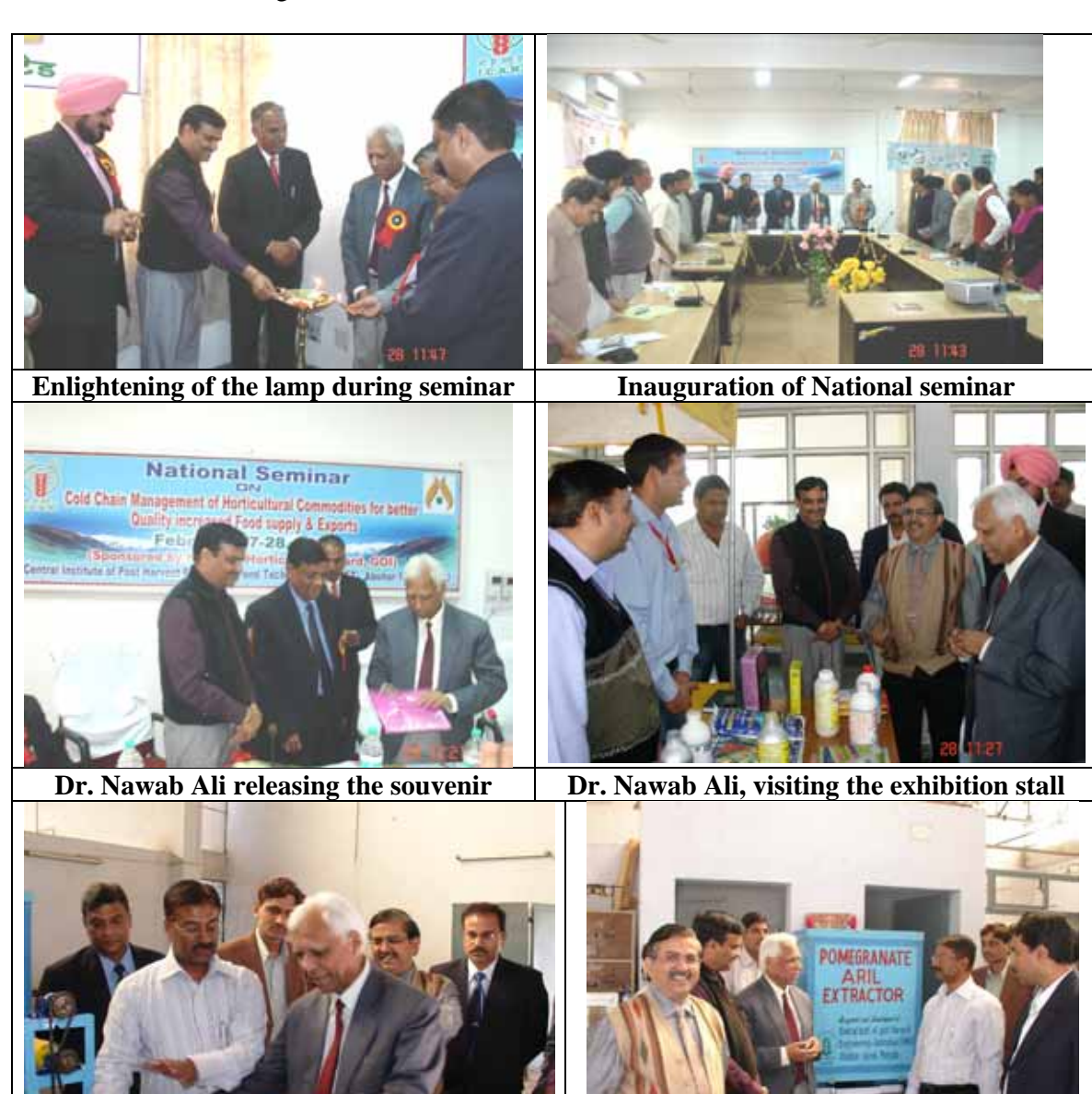
Demonstration of second version of hand tool for pomegranate aril extraction

maintenance, scope of blast chiller, hybrid cold storage system and microbial activities in harvested fruits and vegetables under cold chain conditions.