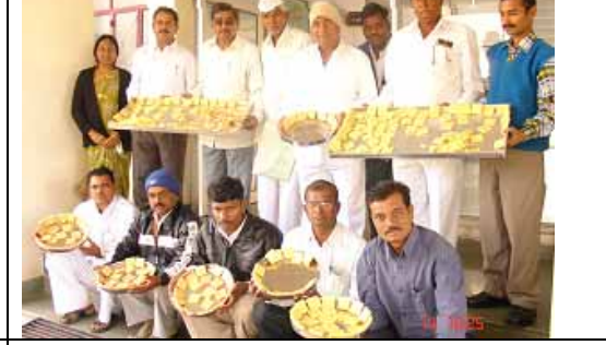
One week EDP on guava processing