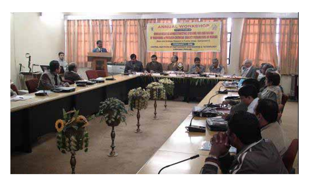
Annual Workshop of NAIP Project on Non-Destructive Systems for Microbial and Physico-Chemical Quality Parameters of Mango

together to accelerate the R & D in the field of nondestructive methods of quality evaluation of food in India.