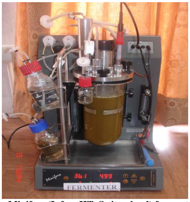
2.5 litre Minifors (Infors HT, Switzerland) fermenter used for ethanol production from sugarcane juice

Sugarcane is normally used for sugar production in India. Sugarcane juice is a preferred drink in India, especially in summers. However, disease and insect infested canes or shriveled and rotten canes have to be separated from the healthy canes for processing. Thus, the juice from such unwanted canes could be used for ethanol production, which could be used as bio-fuel to supplement the energy needs of the country. At CIPHET, we have attempted to develop a rapid process for ethanol production from sugarcane juice.