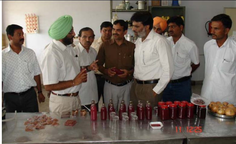
Practical training by participants